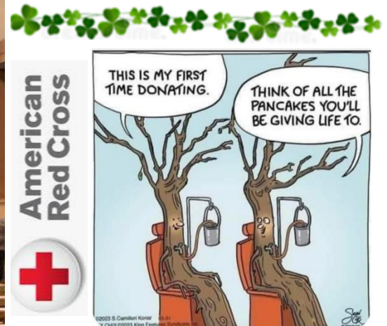
Remember to donate blood, Red Cross can always use it.