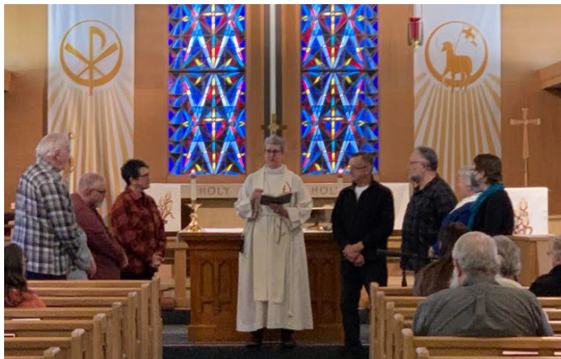
Installation of Council Members during Worship.